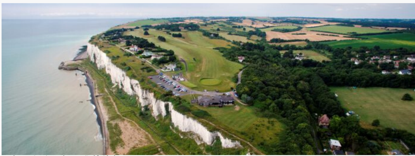
Walmer & Kingsdown Golf Club