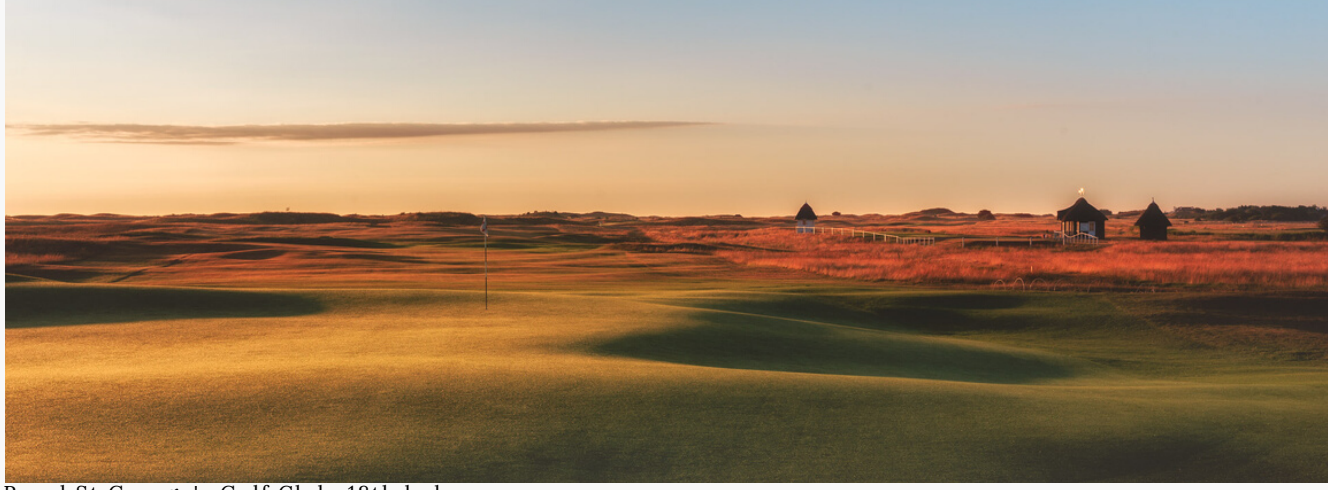
Royal St George's Golf Club, 18th hole