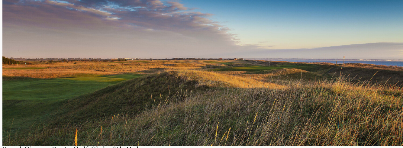
Royal Cinque Ports Golf Club, 6th Hole

You may wish to offer goods branded up with your company's logo for your customers to take away with them - reminding them of you and encouraging them to return. See the marketing protocol section on pg 17 to ensure you follow The R&A's copyright rules.