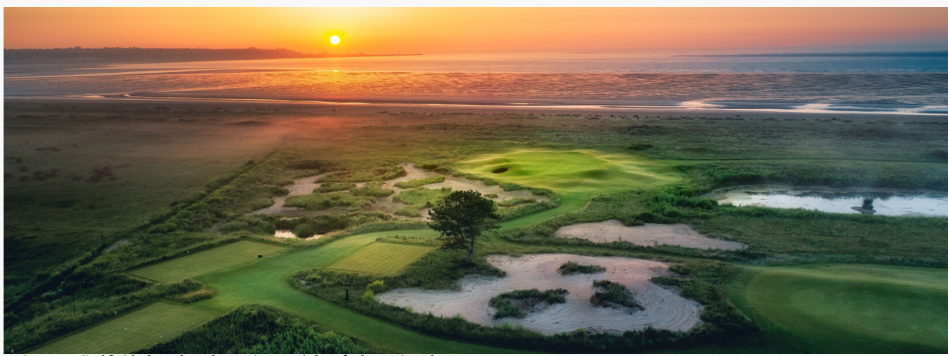
Prince's Golf Club, Bloody Point - 5th of the Himalayas

For more information, contact your local Council. Dover District Council: Licensing@Dover.gov.uk